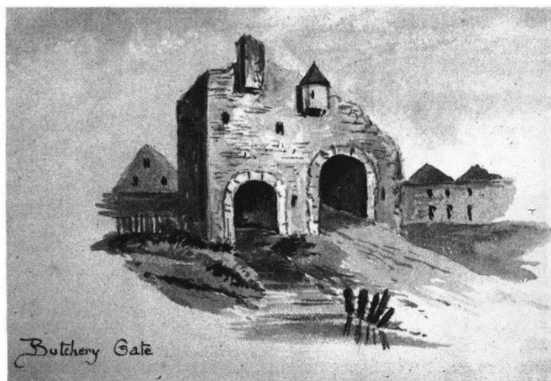
Fig. 2 Painting of Butchery Gate c.1750, watercolour, artist unknown.

useful information concerning the wall and gates. 30 One map in particular, dated 1541, appears to show four gates and two towers (the western tower possibly 'Old Snargate') along the south wall from the eastern cliff under the castle to Snargate, where the line of the wall turned inland ( Fig. 3 ). This appears to fit fairly closely with Leland's list, though he noted three, not two, gates to the east of the river. From the east cliff to the river these gates were: Wardes gate or Eastbrook gate, Cross gate or St Helen's gate, and Segate, le postern or Fisher's gate. Documentary sources also indicate the presence of a tower, called Tynker's tower, which was between Wardes gate and Cross gate. 31 Though probably contemporary with the wall, Tynker's tower was named after James Tynker, who may have rented it from the civic authorities in the fifteenth century, but as yet no details of the rent paid have been uncovered. 32 This part of the wall near the tower, to the south and south-west of St James' church, apparently suffered considerable damage from the sea during the late fifteenth and early sixteenth centuries. As a result, the chamberlains had to pay to fill in a hole in the wall close to the tower in 1474; and in 1501 the town sought to protect the tower and wall by building hedges on the seaward side as part of the 'wyke' sea defences. 33 Such measures were insufficient,