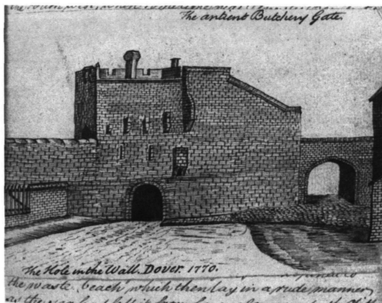
Fig. 1 The Butchery Gate (Hole in the Wall) in 1770 by Thomas Pattenden (pen and ink) from 'Historical Account of the Town of Dover', Thomas Pattenden (unpublished manuscript dated 1802).

some protection from the sea to the wards in St James' parish, as well as those in the town parishes. Some of the land within the liberty would have been outside the wall, as at Canterbury, for example, but the exact extent of these extra-mural lands will remain a matter of conjecture pending further archaeological excavations along the line of the wall.